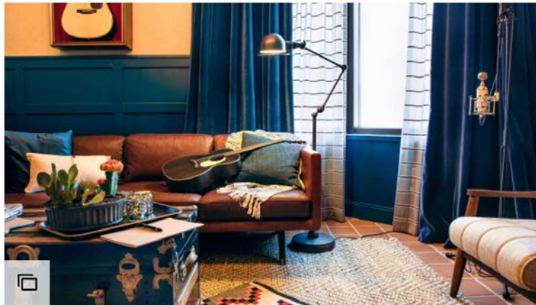
Country star Dierks Bentley not only co-designed a studio room, he also recorded his latest album there.