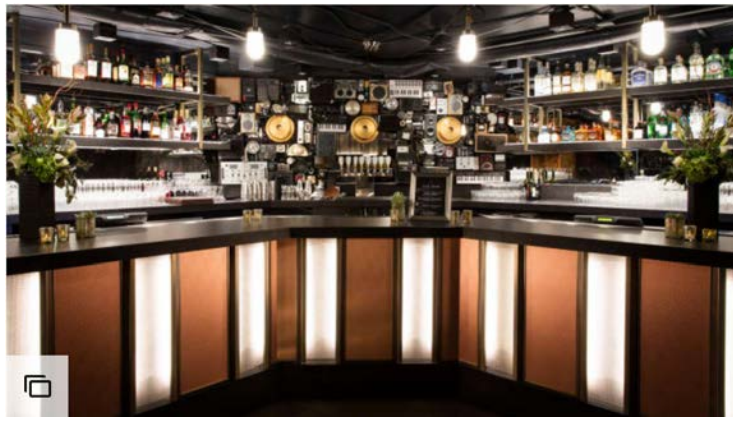
The Hutton's downstairs bar, Analog, also has musical inspirations.